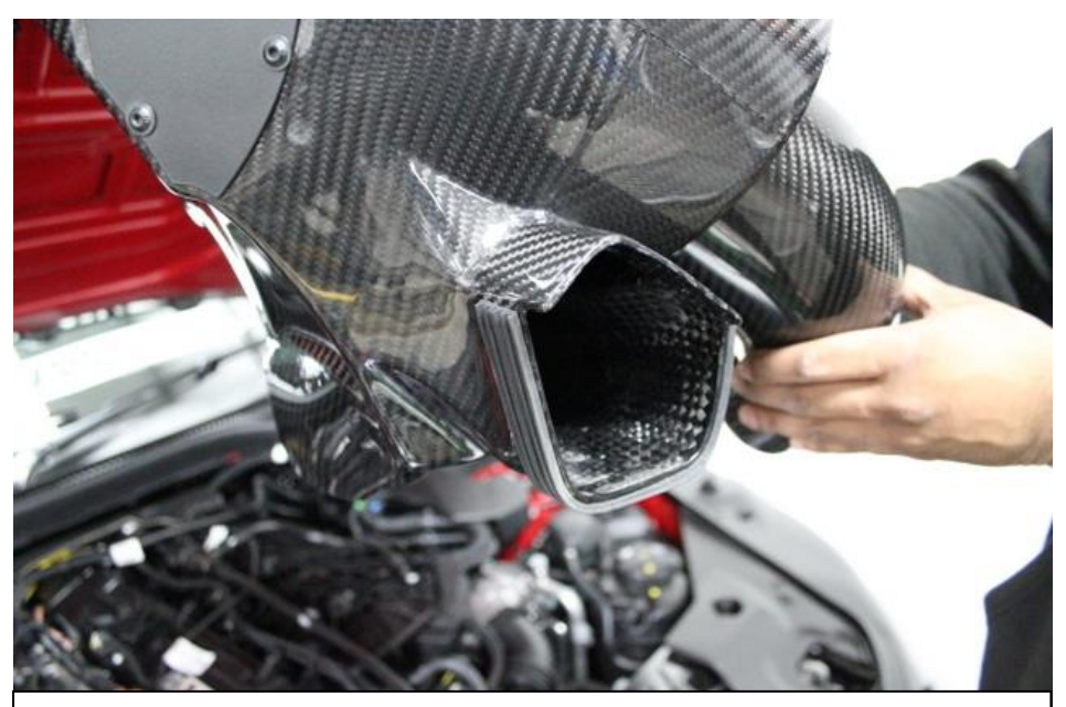
21. The main opening of the airbox should sit inside the stock duct – next photo.