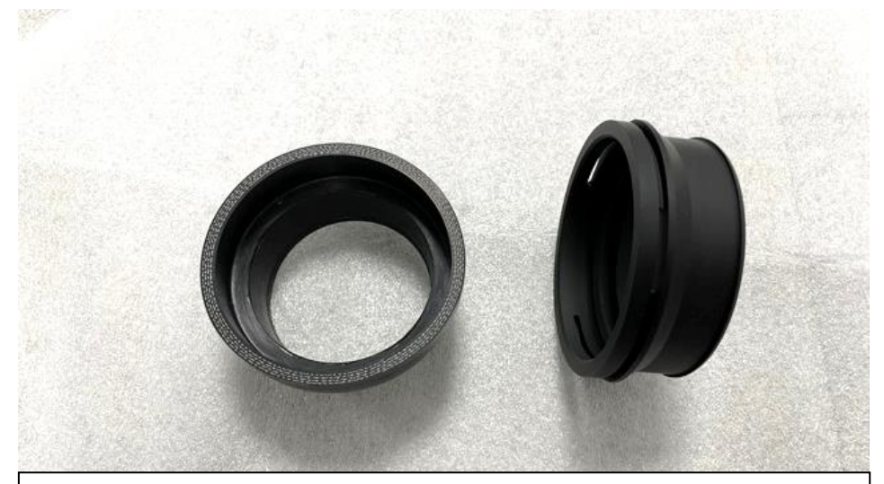
8. Take the machined flange and the silicon reducer – we will now prepare these for installation onto the turbo inlet.