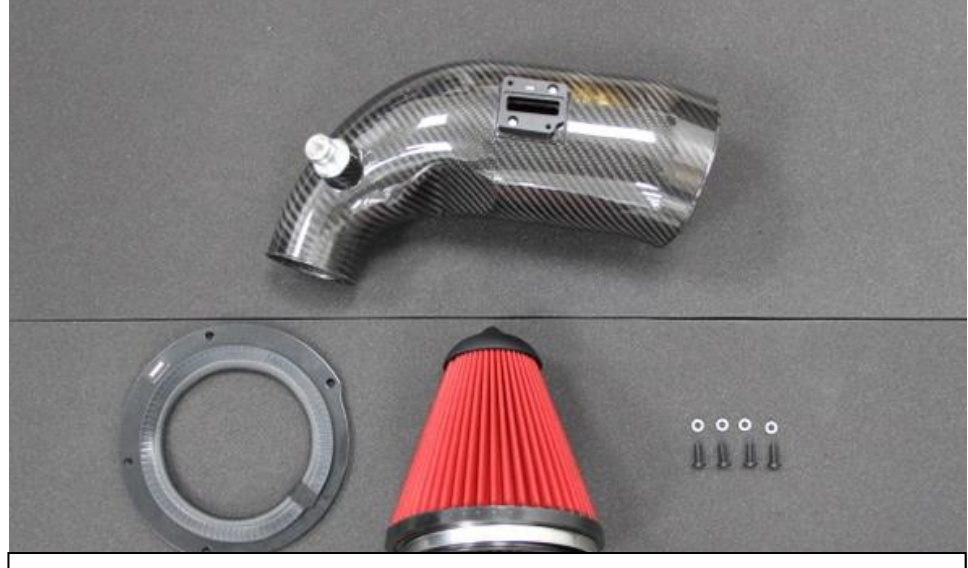
14. Take the inlet tube, filter, sealing plate and the M5 screws with lock washers.