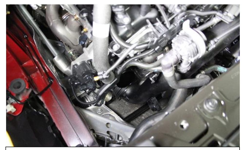
6. Remove the inlet tube completely from the engine.