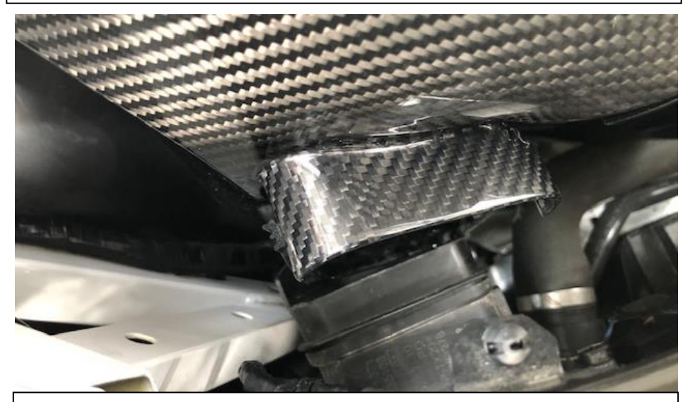
24. Bring it down at a slight angle with the front duct to locate the mounts and the secondary scoop as above.