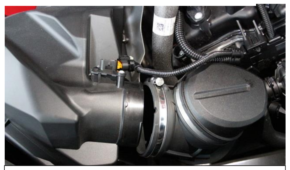
1. We will start by removing the stock airbox. Loosen and remove the rubber inlet tube and disconnect the temperature sensor plug.