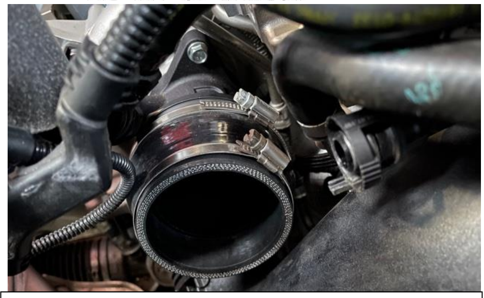
13. Install the flange assembly onto the turbo inlet – it will click into place.