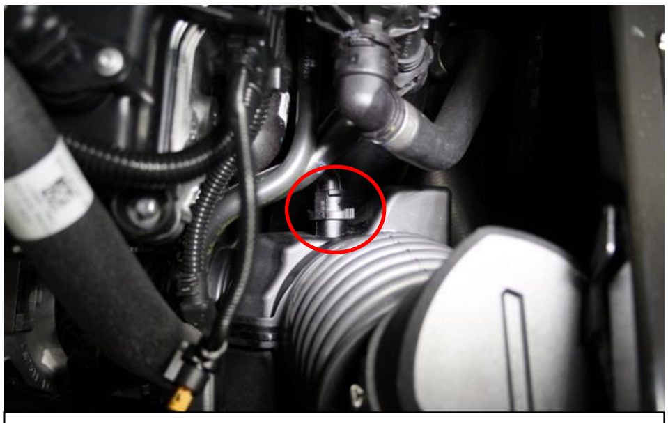
5. Remove the breather connector from the tube.