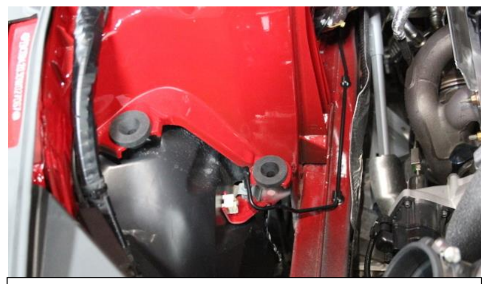
2. The airbox can now be pulled out. Make sure the rubber mounting bushes are still on the car – if not, remove from the airbox and install back onto the chassis.