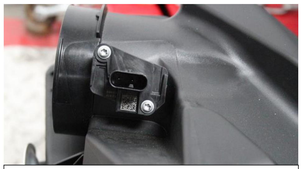
7. Remove the temperature sensor from the airbox.