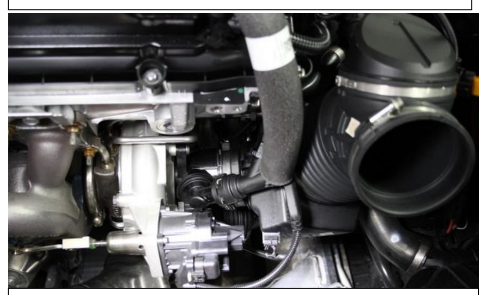
3. To remove the rubber intake tube – firstly pull out the spring clip around the tube at the turbo inlet end. The next photo shows a close up.