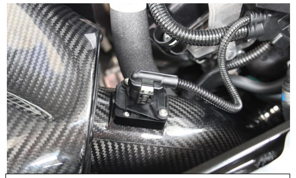
28. Connect the temperature sensor plug.