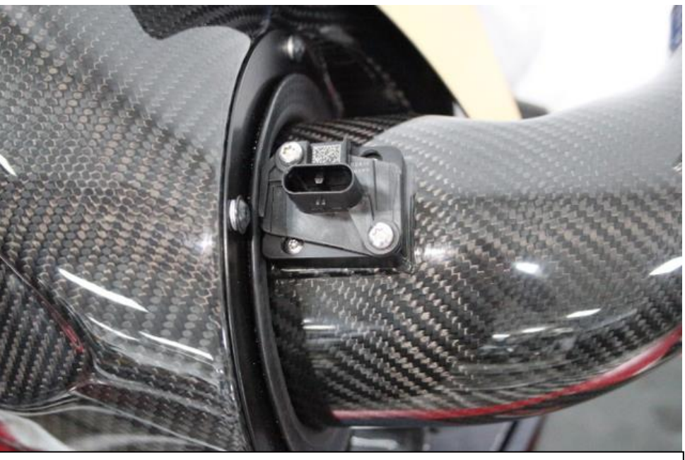
18. Install the temperature sensor onto the tube using the supplied screws. DO NOT use the stock screws.

17. Another view of the sealing plate secured to the airbox.