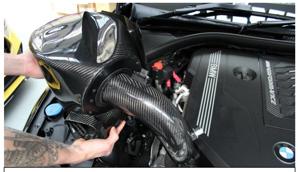
23. Lower the airbox with the tube angled downwards and ensure the mount and secondary scoop go into place as described previously.