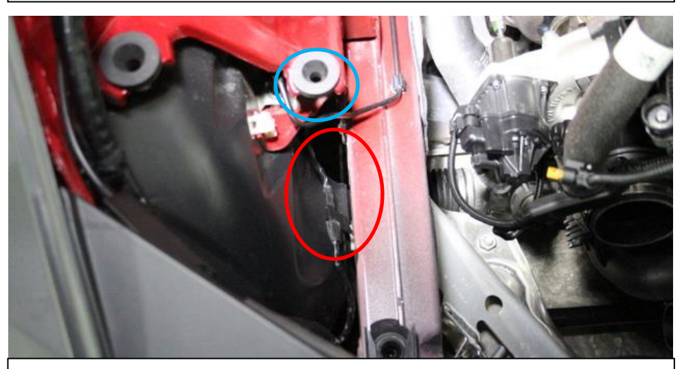
20. Gap in the wheel arch area and rubber mount.

19. Carefully lower the airbox into the engine bay. Note that the secondary scoop circled above goes into the gap shown in the next photo. Also the mount circled blue should sit in the rubber mount shown in next photo.