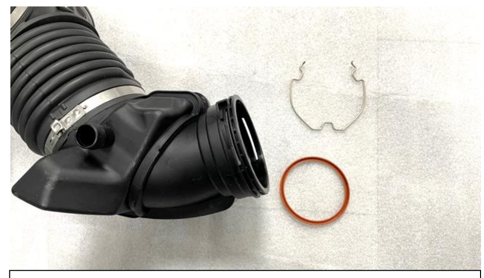
9. Remove the rubber O-ring from inside the OEM tube and also the spring clip.