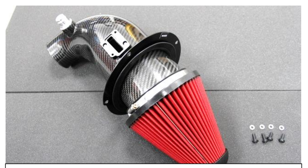
15. Push the sealing plate onto the tube – ensure the INSIDE label is facing the filter side. Now push the filter fully onto the tube and secure with the attached clamp.