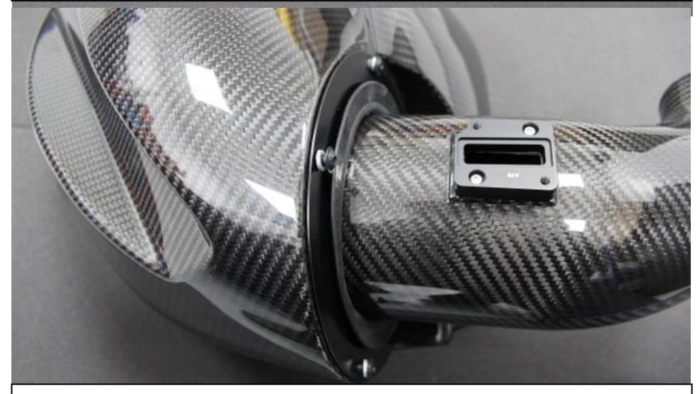
16. Insert the filter into the airbox and line up the holes on the sealing plate. Secure with the supplied M5 screws and lock washers.