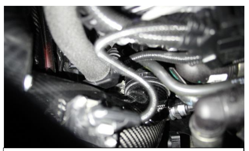
27. Secure the remaining hose clamp around the carbon tube – DO NOT overtighten.