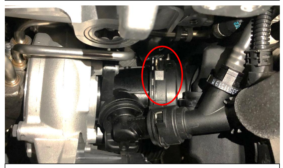
4. Pull the spring clip away from the tube flange and this will allow you to pull the tube away from the turbo. There is also a breather connector to remove – see next step.