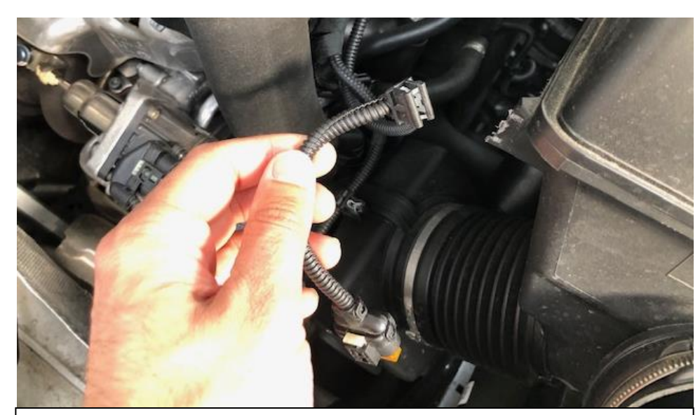
3. Unclip the sensor wire from the secondary box.