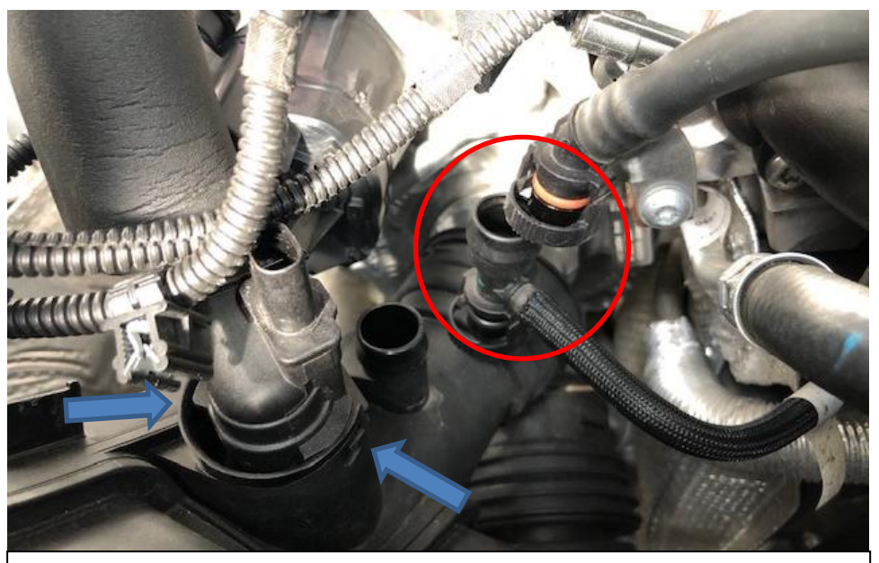
6. Remove the breather hose (red circle) and also the large ventilation line which has the sensor built in. This can be removed by pressing in the clips on both sides (blue arrows) and