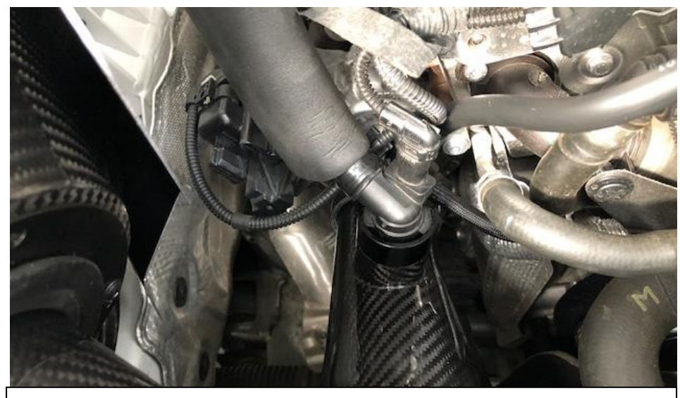
21. Push the larger ventilation tube into place ensuring the side tabs click into the holes. Also push the sensor plug back in.