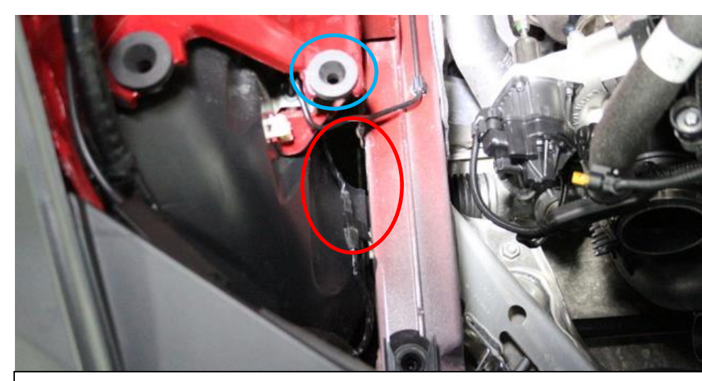
14. Gap in the wheel arch area and rubber mount.