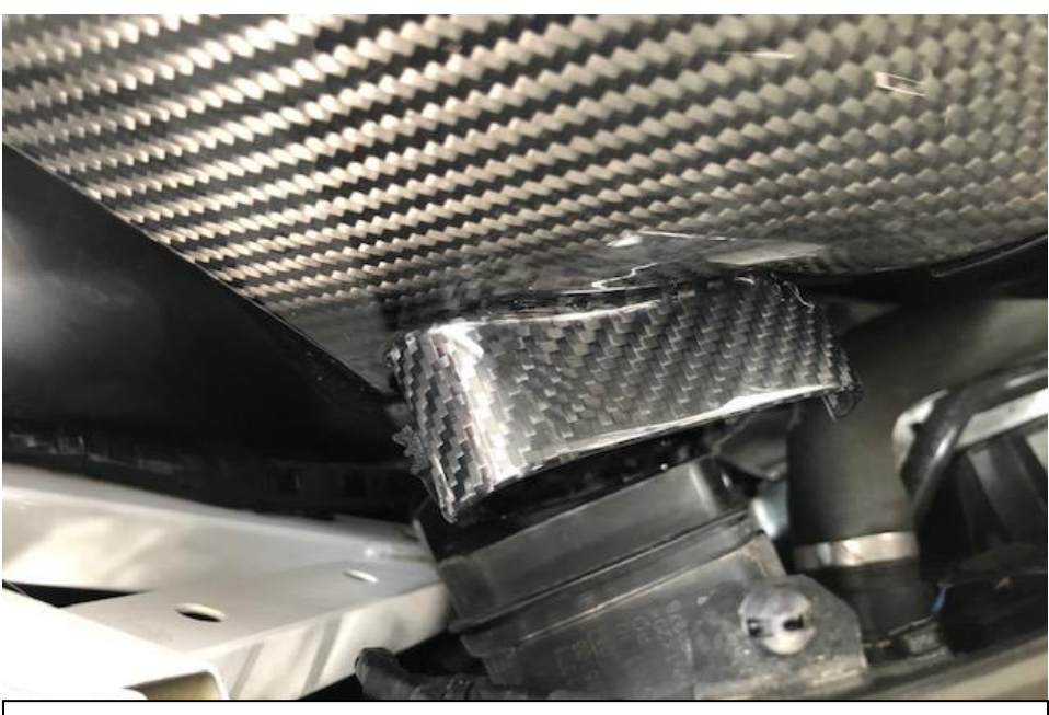
18. Bring it down at a slight angle with the front duct to locate the mounts and the secondary scoop as above.