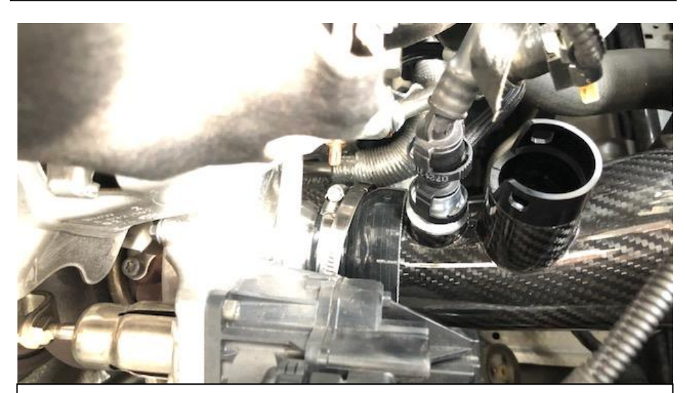
20. Insert the tube into the silicon and connect the breather plug. Now secure the remaining hose clamp around the carbon tube. DO NOT OVERTIGHTEN.