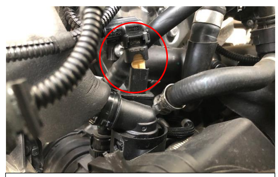
5. Disconnect the plug on the inlet tube near the turbo.