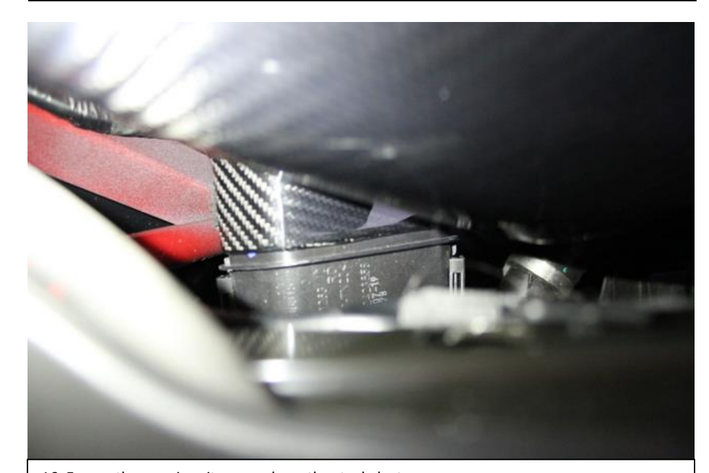
16. Ensure the opening sits squarely on the stock duct.