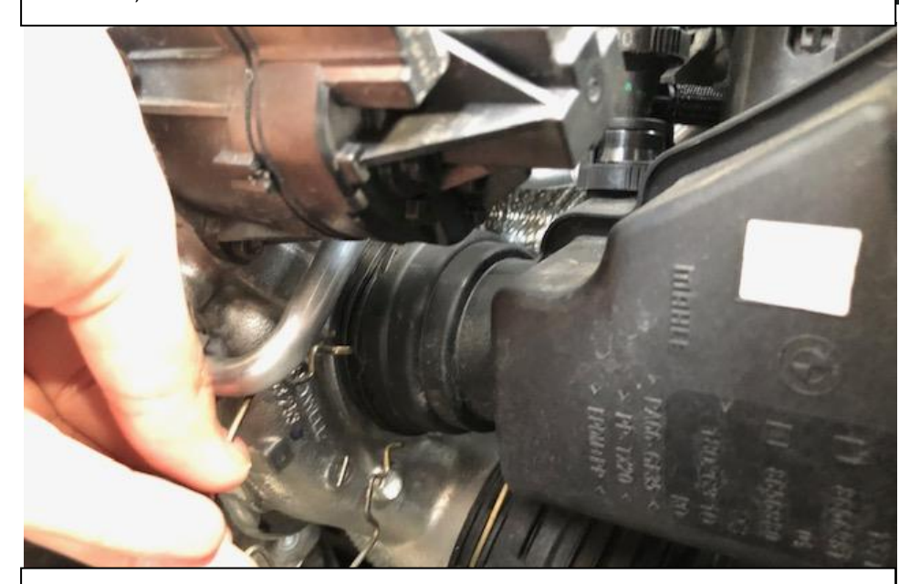
4. Pull the spring clip away from the turbo tube flange and this will allow you to pull the tube away from the turbo. Pull the tube off the turbo and then proceed to remove the breathers – see next steps.