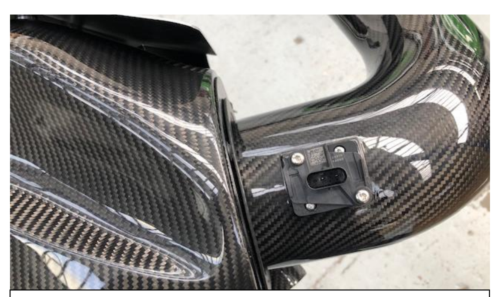
12. Install the temperature sensor onto the tube using the supplied screws. DO NOT use the stock screws.