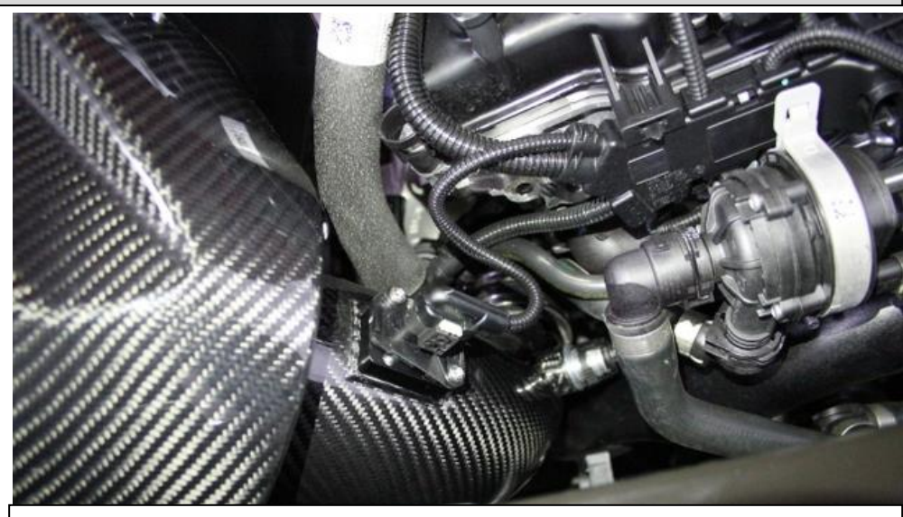
22. Connect the sensor plug on the intake pipe.