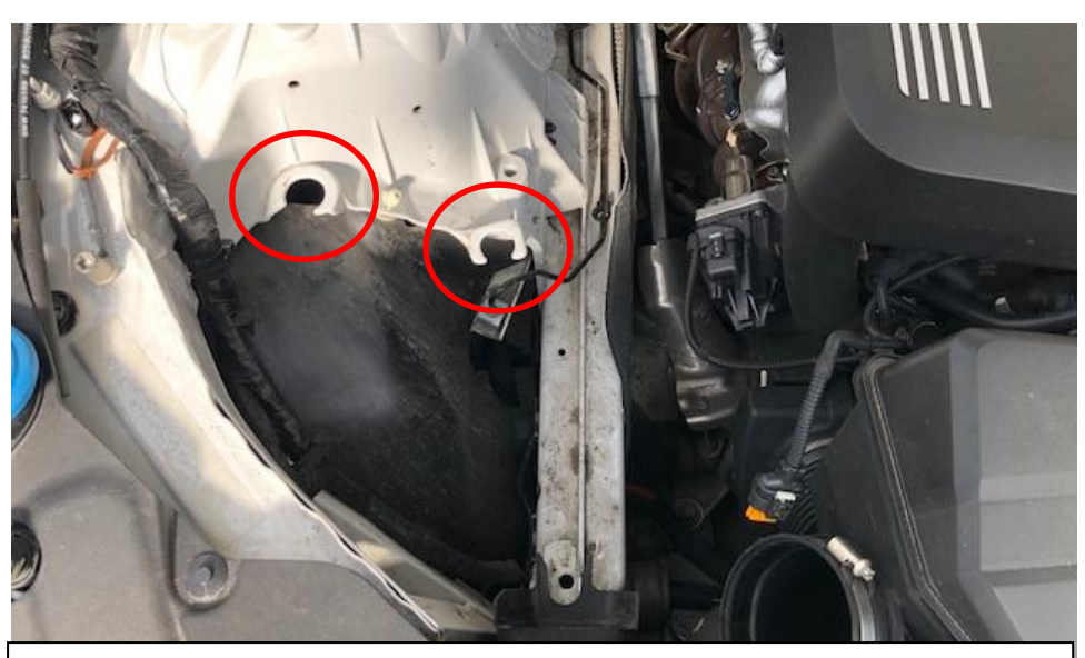
2. The airbox can now be pulled out. Make sure the rubber mounting bushes are still on the car – if not, remove from the airbox and install back onto the chassis.