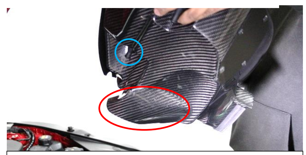
13. Carefully lower the airbox into the engine bay. Note that the secondary scoop circled above goes into the gap shown in the next photo. Also the mount circled blue should sit in the rubber mount shown in next photo.