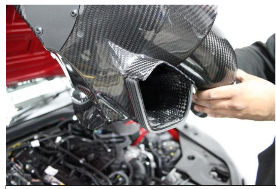
15. The main opening of the airbox should sit inside the stock duct – next photo.