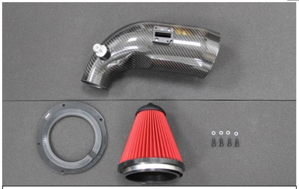
9. Take the inlet tube, filter, sealing plate and the M5 screws with lock washers.