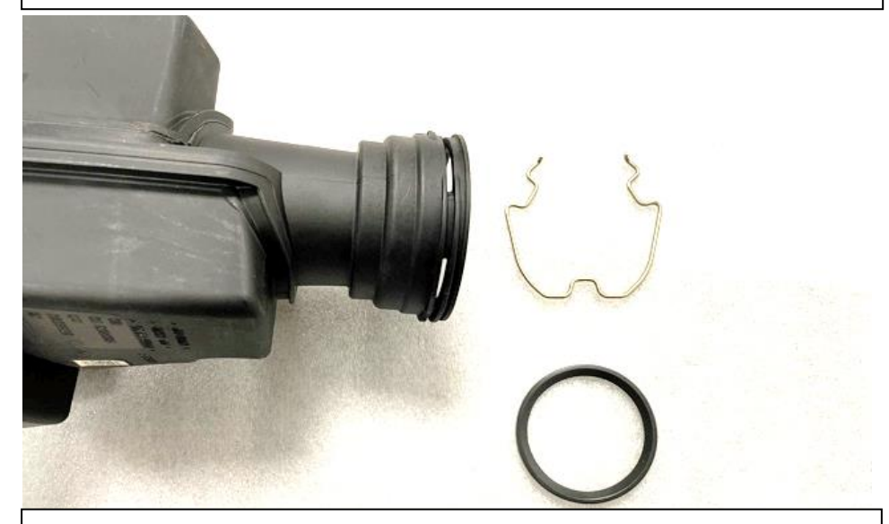
8. Remove the clip and the internal ring gasket from the OEM tube at the turbo side. Note the orientation of the gasket before removal - it needs to be in the same direction on the new flange.