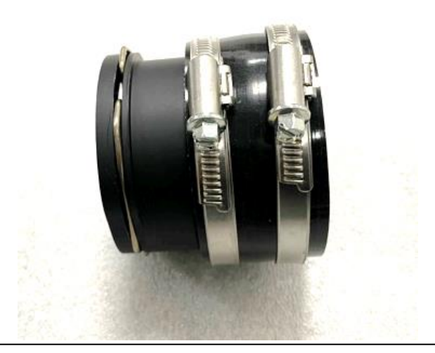
8d. Now push the provided silicon onto the flange with the 2 hose clamps and only tighten the clamp around the flange

8b. Insert the O-ring into the new flange as shown. The flat face of the O-ring should face the turbo side.