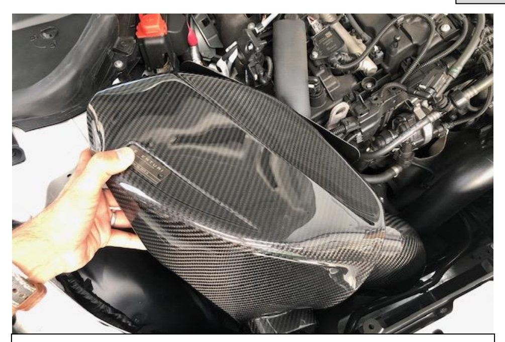
17. Carefully lower the airbox - will be easier without the engine cover in place.