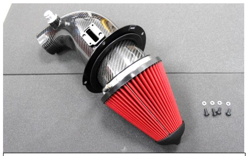
10. Push the sealing plate onto the tube. Now push the filter fully onto the tube and secure with the attached clamp.