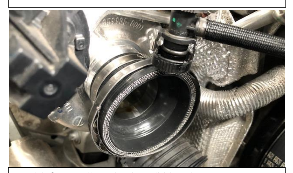
8e. Push the flange assembly onto the turbo - it will click into place.