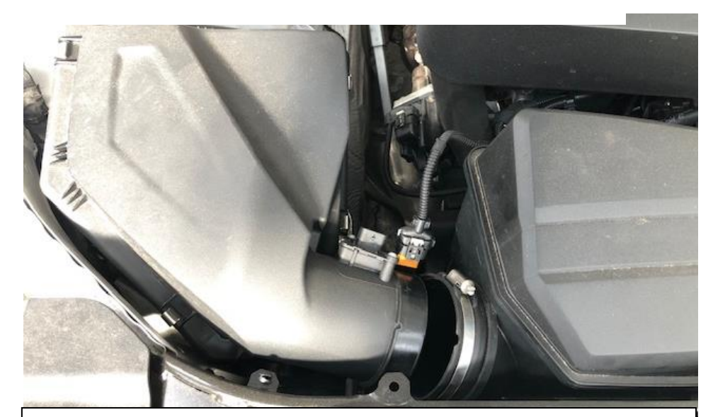
1. We will start by removing the stock airbox. Loosen and remove the rubber inlet tube and disconnect the sensor plug.