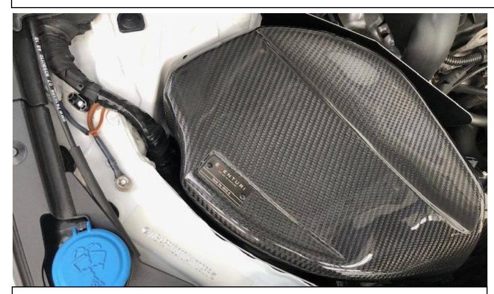
19. Locate it into the 2 mounts and press firmly into place.