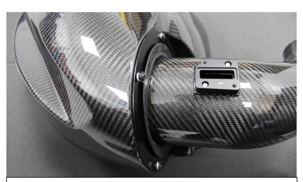
11. Insert the filter into the airbox and line up the holes on the sealing plate. Secure with the supplied M5 screws and lock washers.