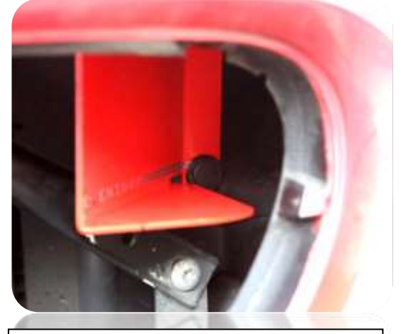
23. Insert supplied plastic push clips and firmly push in the heads so that they click into place and lock the scoop. Re-install the grill.

You have now completed the installation of the Eventuri Z4M System.