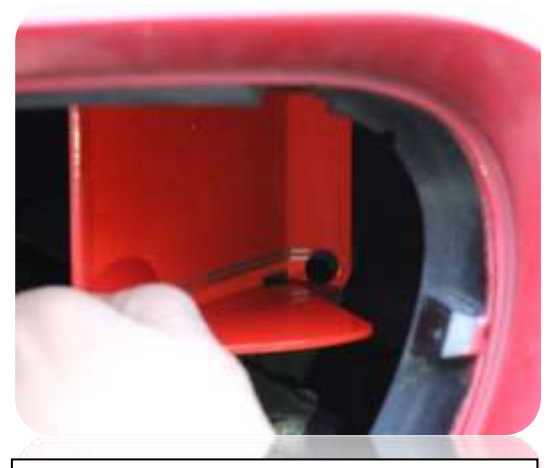
22. Put new scoop in place by lining up the mounting holes to the back panel where the original duct was secured.

21. Photo showing plastic push clips which secure the original duct in place.