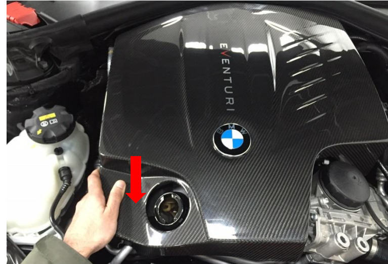
6. Finally push the remaining bottom left mount into place – you may need to push the cover to the right to line this one up.