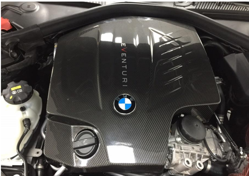
7. Put the Oil Cap back on. Installation is complete.