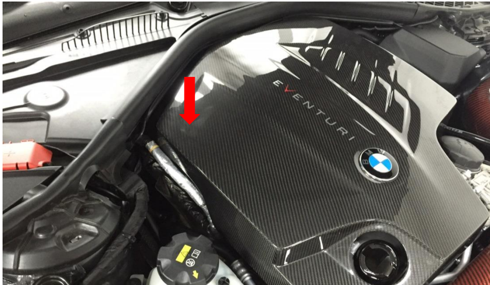
5. Now push the top left mount into place.