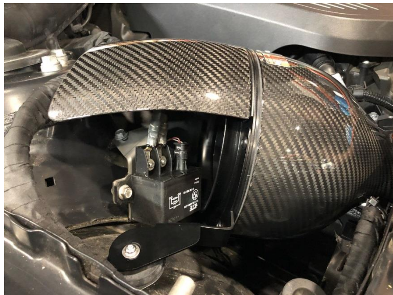
6. Once the intake is installed – the relay will sit in front of the filter.